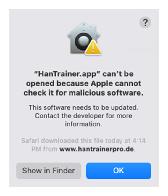
Screenshot 3: Warning from apps that have been downloaded from the internet

5. If the following message appears, please confirm with "OK" and repeat step 4.