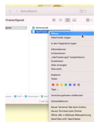
screenshot 2: contect menu (after right-clicking the App)

5. If the following message appears, please confirm with "OK" and repeat step 4.