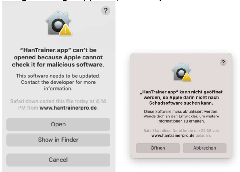
Screenshot 4: Warning from apps that have been downloaded, from the internet (including "open" button)

6. If the following message appears, click "open"